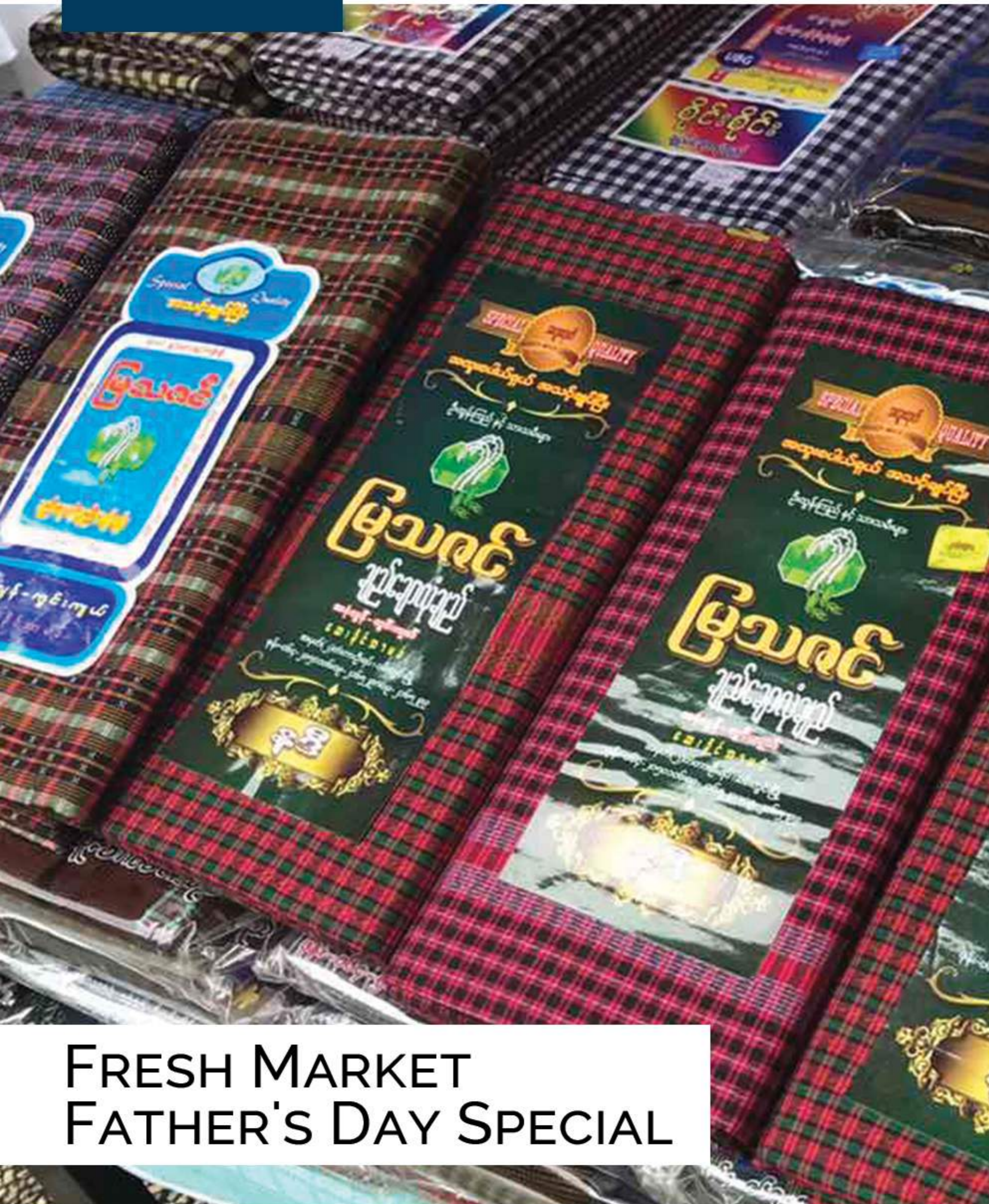
FRESH MARKET FATHER'S DAY SPECIAL