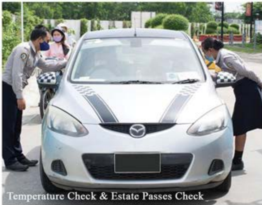
Temperature Check & Estate Passes Check