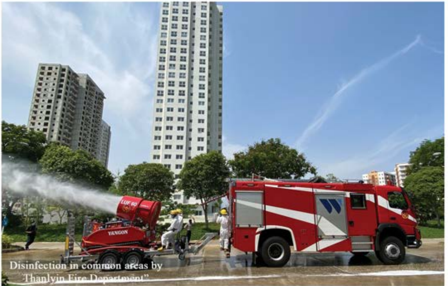
Disinfection in common areas by Thanlyin Fire Department”