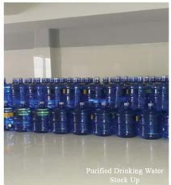
Purified Drinking Water Stock Up