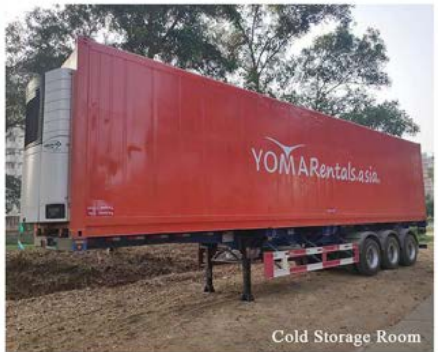
Cold Storage Room