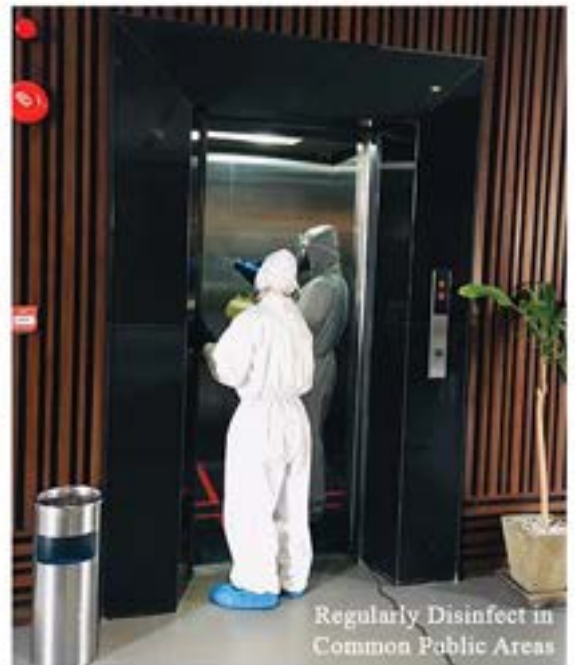
Regularly Disinfect in Common Public Areas