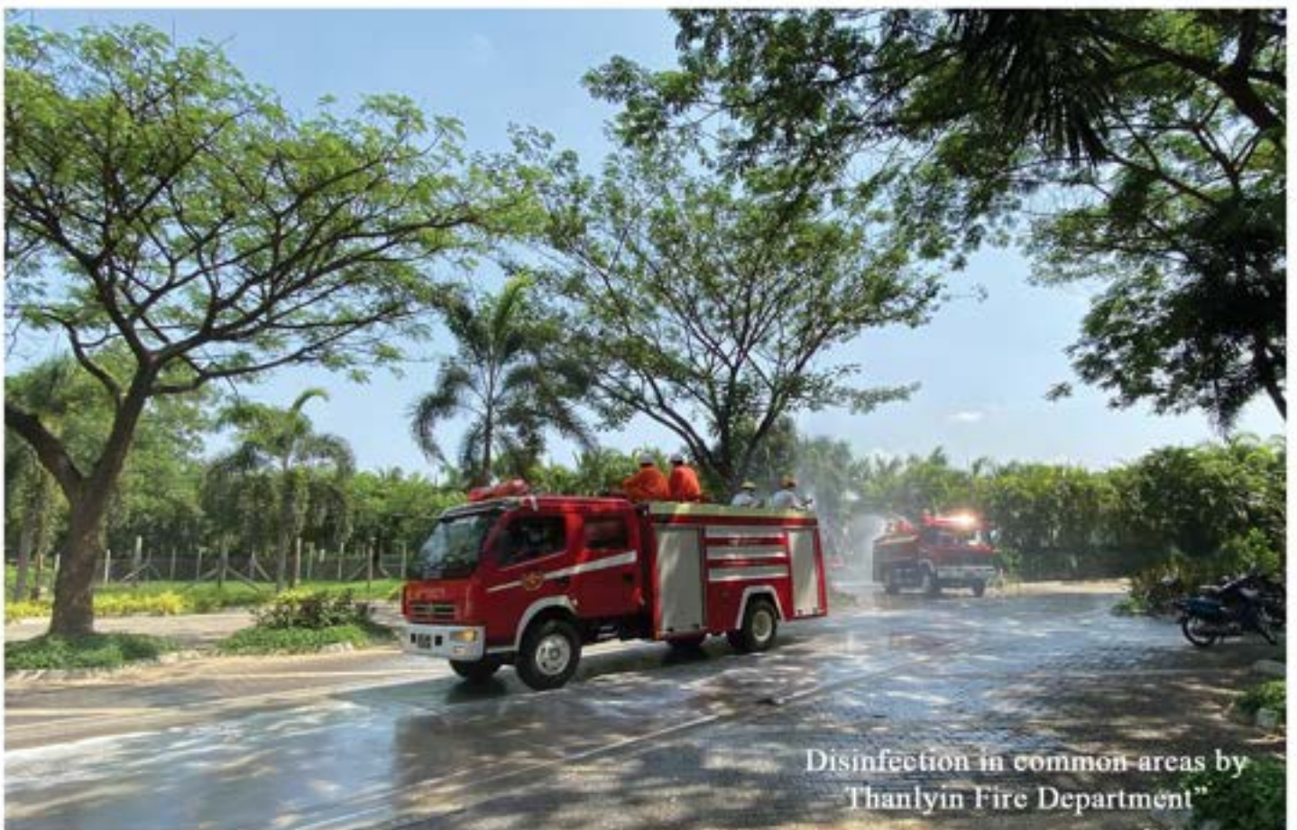
Disinfection in common areas by Thanlyin Fire Department”