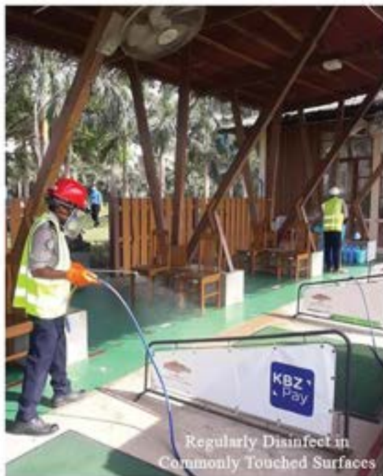
Regularly Disinfect in Commonly Touched Surfaces