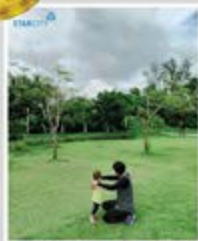
Chit Thee Bonza