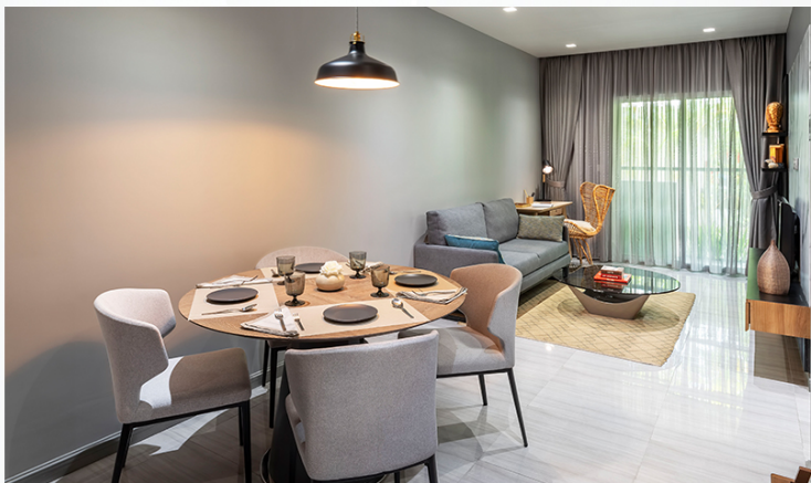
#CityLoft #Whereitallbegins #YomaLand

Looking for a small family home within a safe neighborhood? We would like to introduce our bestselling 2 Bedrooms units in City Loft. The unit sizes are 710sq.ft, a perfect size for a family of 3s. To find out more on the details of the apartment, price and payment structure, our sales professionals are ready to attend to you.