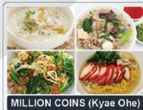
MILLION COINS (Kyae Ohe)