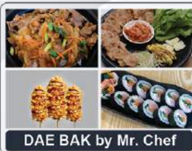
DAE BAK by Mr. Chef