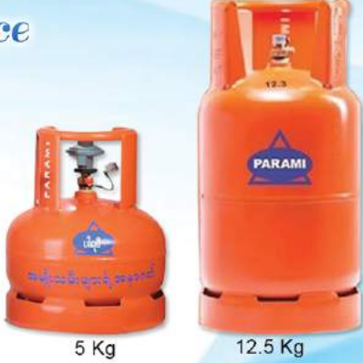
5 Kg 12.5 Kg

Parami Gas အား Star City ကြယ်စင်အိမ်ရာဝင်းအတွင်းတွင် Roayl Peace Company မှ တရားဝင် တစ်ဦးတည်း ကိုယ်စားလှယ်အဖြစ် ဖြန့်ဖြူးပေးနေပါသည်။