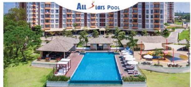
All Stars Pool