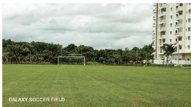
GALAXY SOCCER FIELD