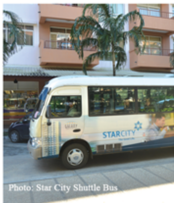
Photo: Star City Shuttle Bus

Yoma Land is constantly exploring new transportation options. One such initiative is water transportation, which will connect StarCity & Pun Hlaing via Pansodan & Kyee Myin Daing to increase connectivity by reducing door to door travel time via a reliable, convenient and desirable mode. Exciting journeys ahead for residents and visitors alike.