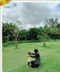
Chit Thee Bonita